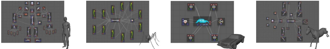
Figure 1. The BlockParty 2 visual rigging interface for four characters: a biped, a spider, a car, and a horse.